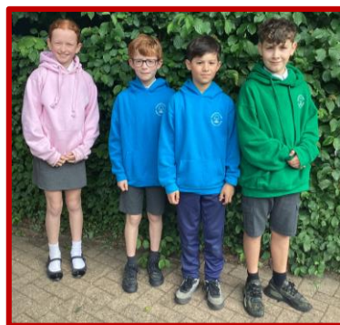
Year 6 House Captains