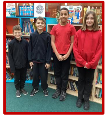
Year 6 House Captains

Last year, our art week linked with languages, in particular French. Each class chose a portrait artist from a Francophone country (a French speaking country) to learn about an artist and then created portraits in a similar style to them. We were so lucky to have a gallery in Ickworth House to share the amazing art from this week, thank you so much to those that came to support it. We hope more of you can come to see our art gallery later in the year after our next art week. and sharing this exciting journey with our children and families.